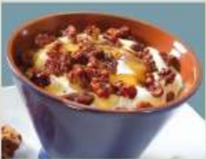
Walnut & Caramel Pot