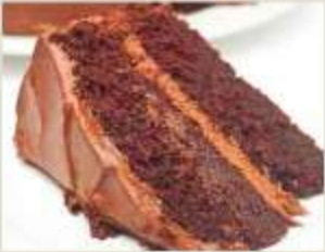
Choc Fudge Cake