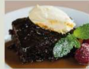
Sticky Toffee Pudding