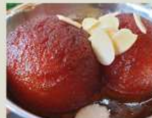
Hot Gulab Jamun