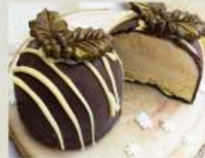
Salted Caramel Bombe